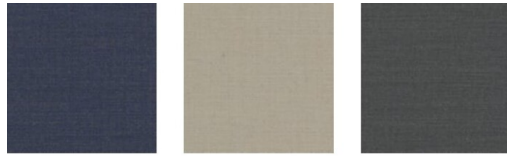
CODY4462* CODY6820* CODY8800*

The colours in stock typically take between 8 and 25 working days to deliver upholstered products, depending on the product and the quantity ordered. Stock colours are also marked with an asterisk (*) on the all colours colour chart.